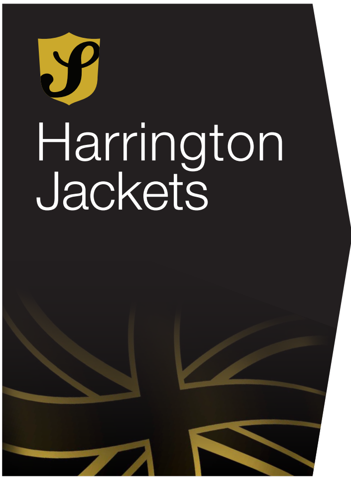
Beige Harrington SCHJ001