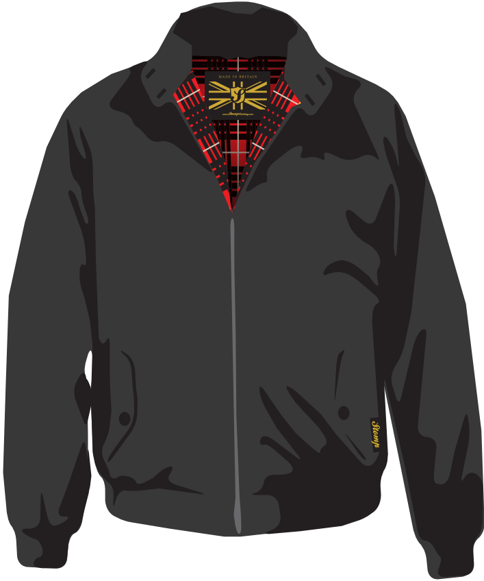
Black Harrington SCHJ004