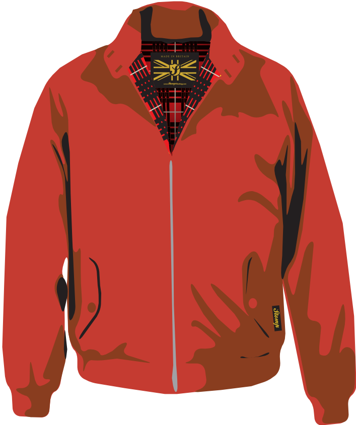
Red Harrington SCHJ006