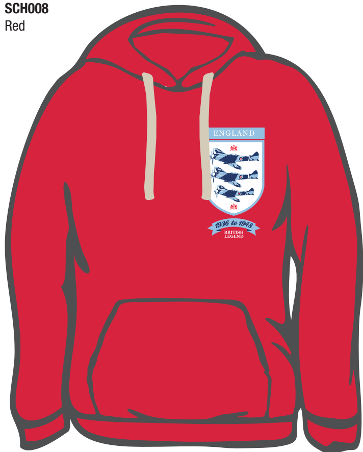
Spitfire SCH008 Red