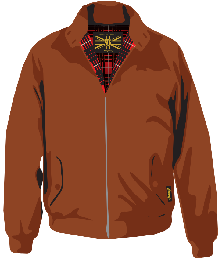
Wine Harrington SCHJ005