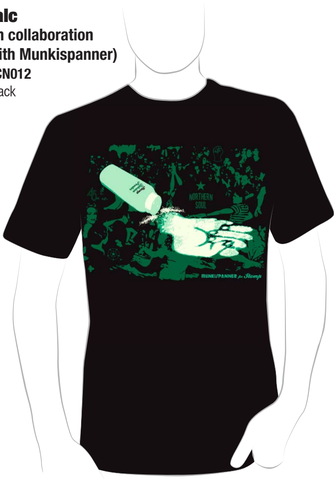
Talc (In collaboration with Munkispanner) SCN012 Black