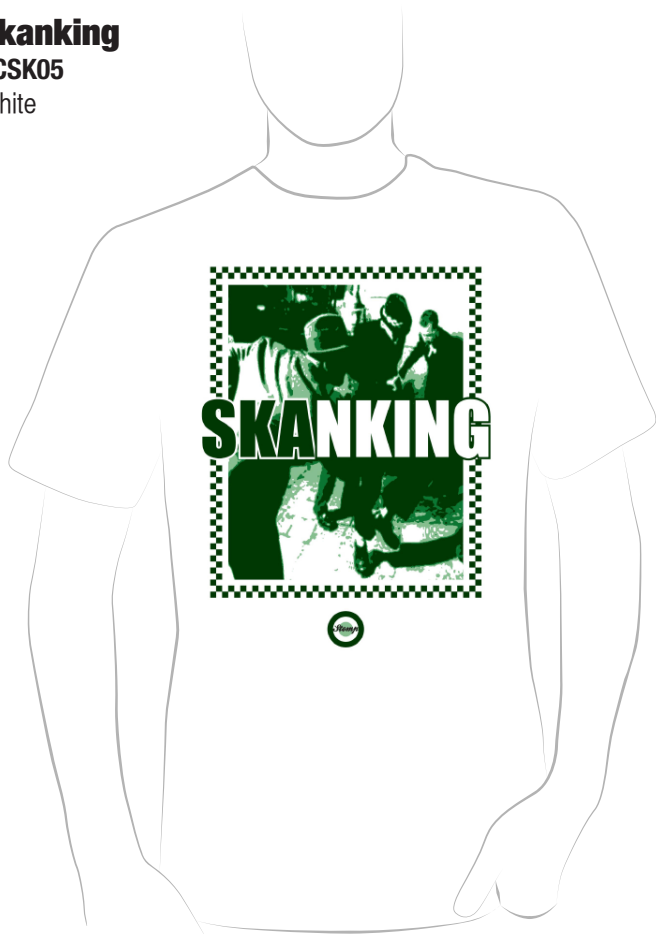
Skanking SCSK05 White