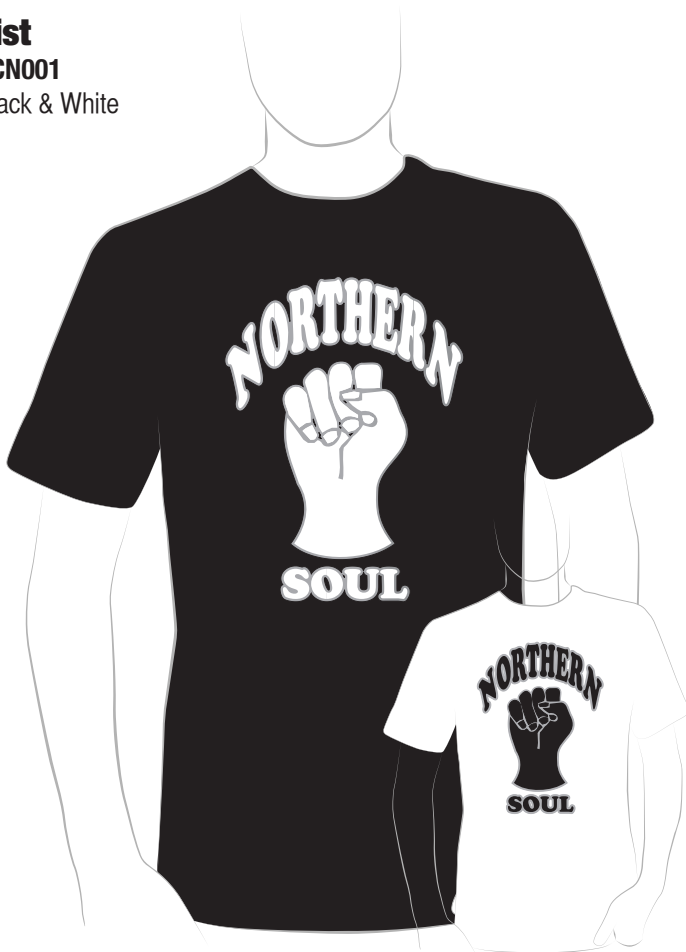
Fist SCN001 Black & White