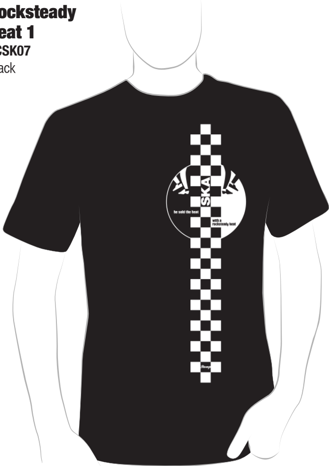
Rocksteady Beat 1 SCSK07 Black