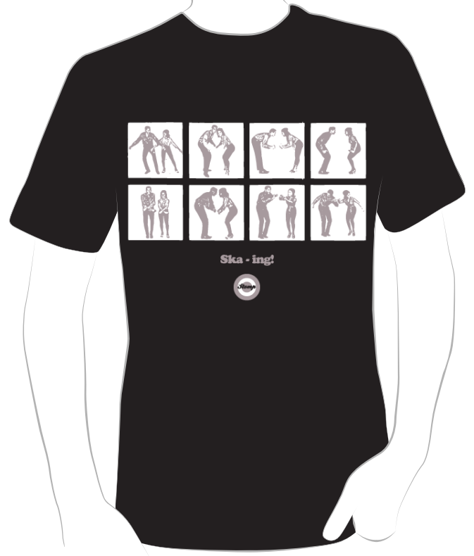
Ska'ing SCSK02 Black