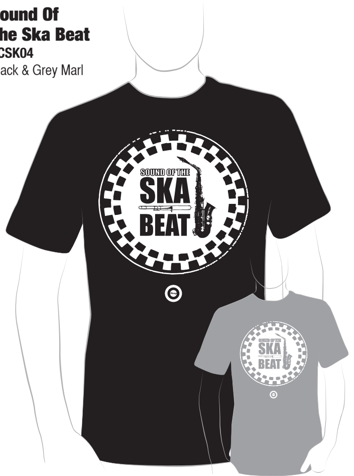
Sound Of The Ska Beat SCSK04 Black & Grey Marl