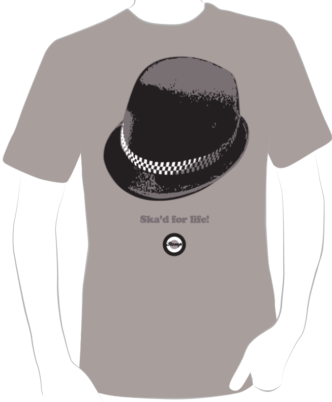
Ska'd For Life SCSK01 Grey Marl