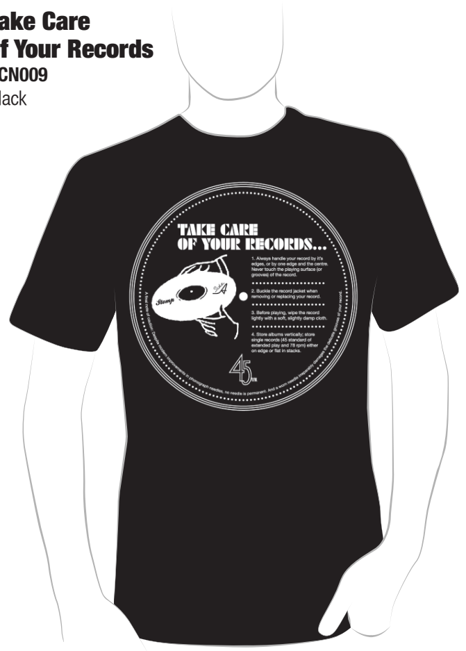
Take Care of Your Records SCN009 Black