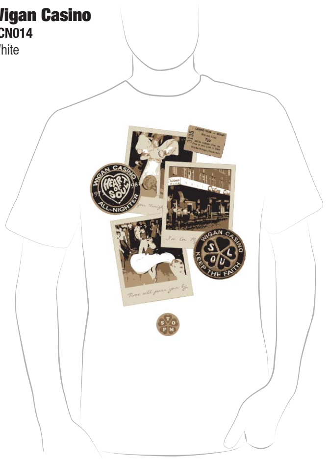
Wigan Casino SCN014 White